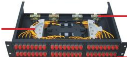
Cable entrance and exit