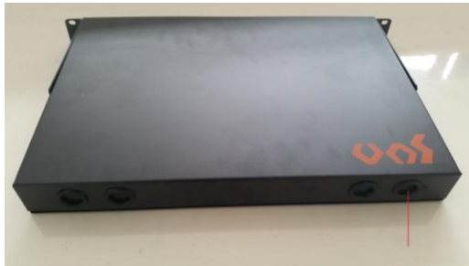
Cable entrance and exit SUN-ODB-RM2C